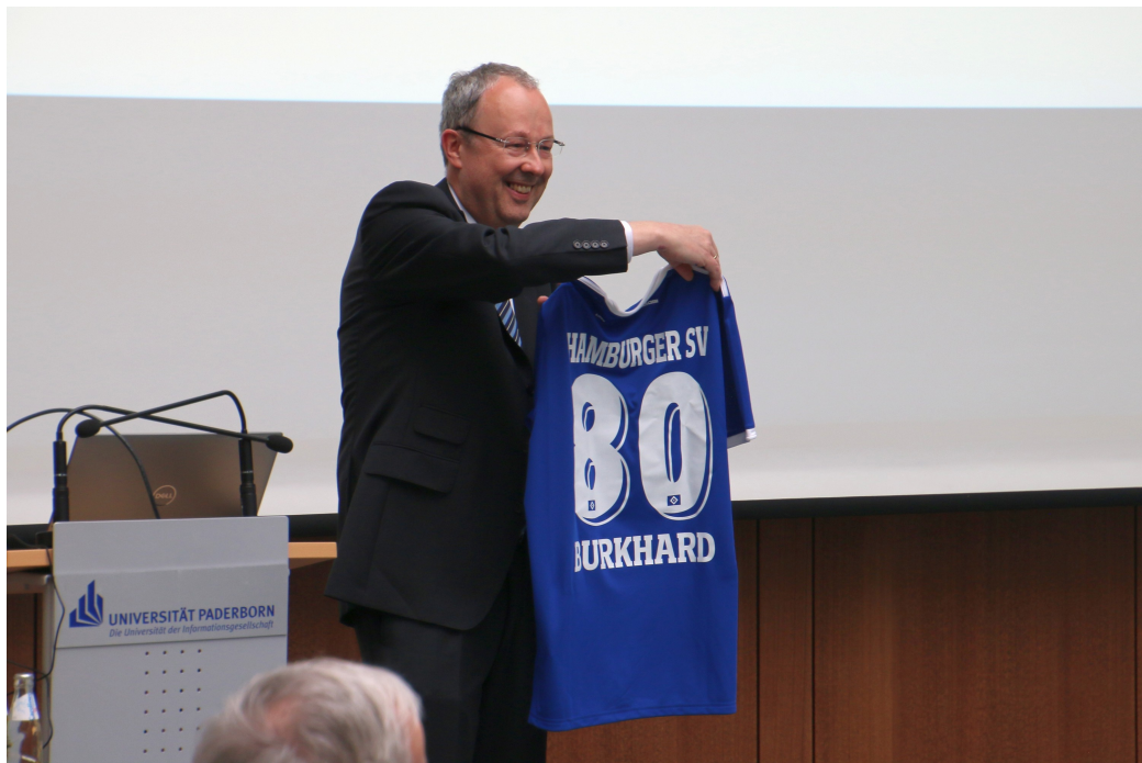
The Vice Dean of the Faculty of Computer Science at Paderborn University presents the jubilarian with a jersey of his favorite soccer club HSV with the number 80 on the back.